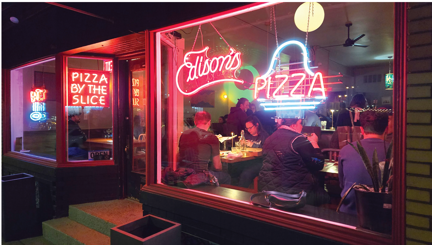
A busy Edison's Pizza Kitchen lights up the street at night outside their new home, 1307 Auburn Ave., the former location of Lava Lounge

We basically started working together that way.”