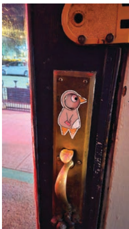
Where's The Bird? Submit your answer to win a Fat Cats gift certificate.

Mail your answer to P.O. Box 6161, Cleveland, OH, 44101 or email to: TheTremonster@TheTremonster.org.