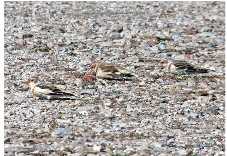
This photo shows how well they can blend into the environment, often making them difficult to see until you are nearly on top of them. Pictured near the Steamship William G. Mather in 2020.

Well adapted to windswept locations, they are birds of wide-open spaces and keep a very low profile while on the ground, often appearing to be legless while hunkered down. Their plumage in winter is quite rightly described as looking like a toasted marshmallow, but in their breeding plumage, they look quite different, with males showing a striking black and white color overall and females losing their buffy highlights. On their breeding grounds in the high arctic where it doesn't get very warm, males set up territories up to a month before the females arrive, and once nesting in rocky crevices, they will feed the females on their nests, so they don't have to leave the eggs to the cold while incubating.