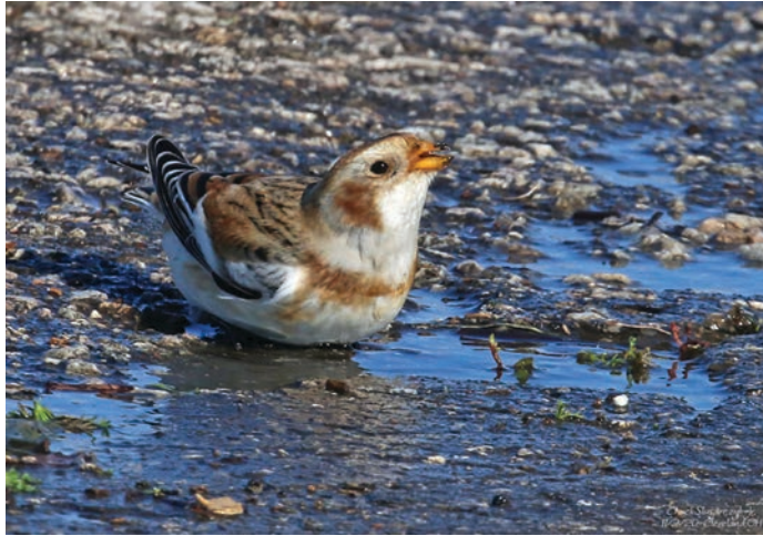
Grabbing a quick drink from a puddle, this Snow Bunting was pictured on the lakefront in 2020.