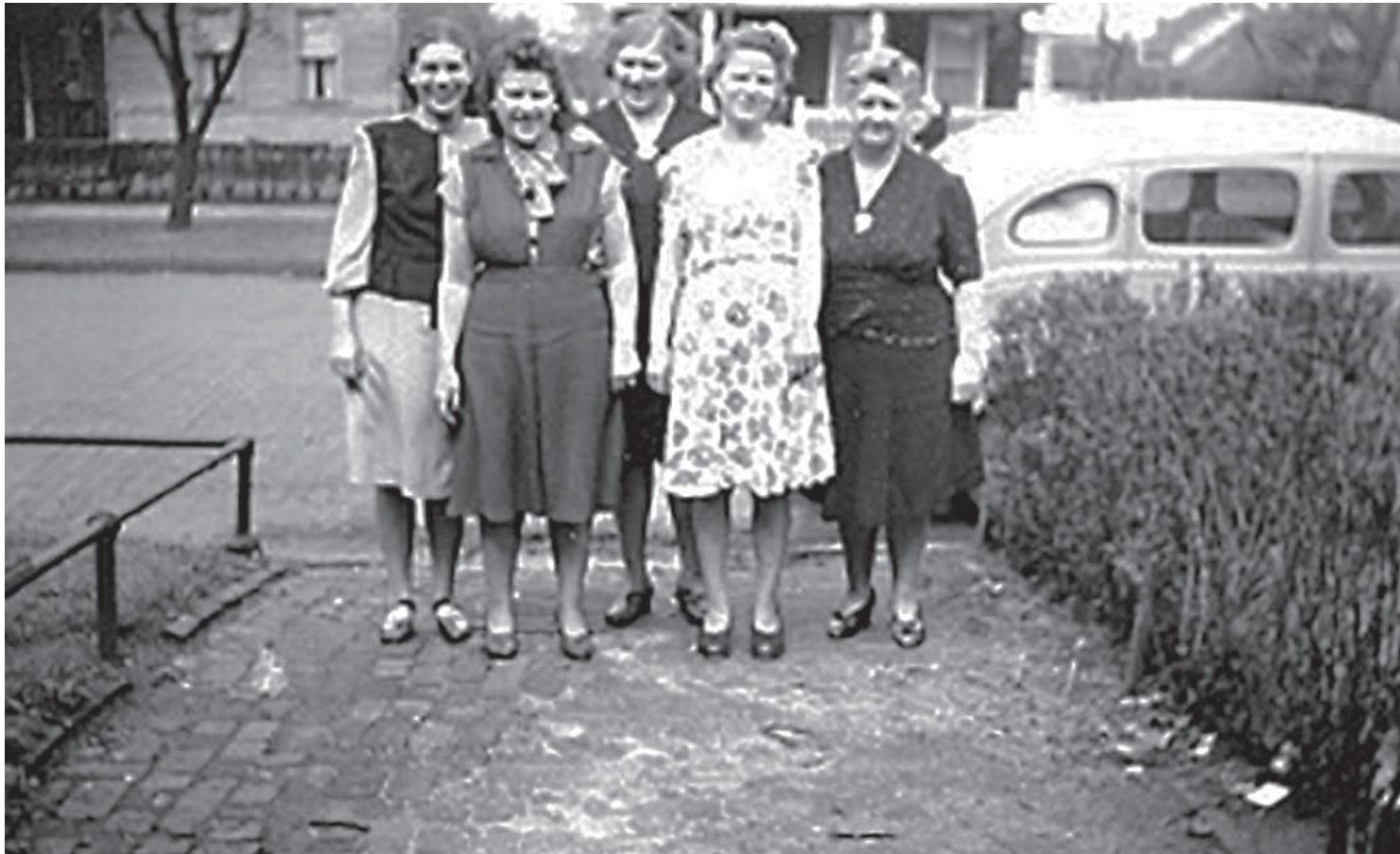
My mom, center, and her four sisters at 2464 Tremont Ave. in 1947.