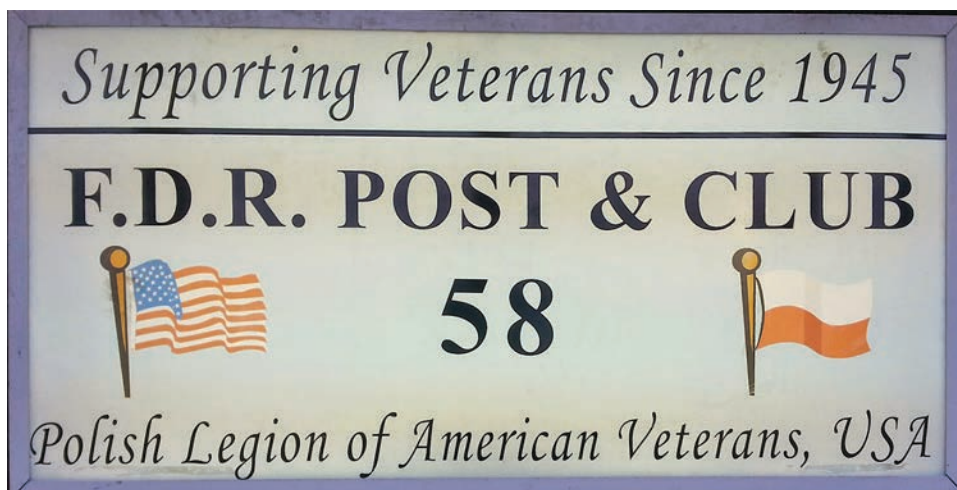
The illuminated sign from the historic Tremont former home of Post 58