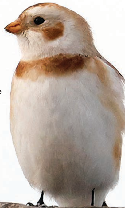
Snow Bunting pictured at E.72nd St. Fishing Pier, 12/24/25.